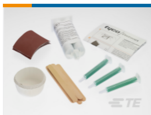
TE Part # 657863-000 S1125-KIT-8